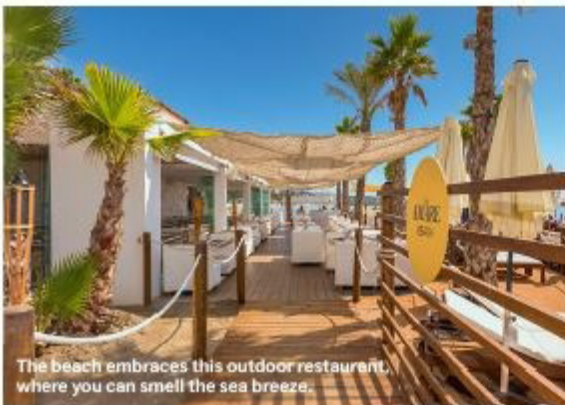
The beach embraces this outdoor restaurant, where you can smell the sea breeze.